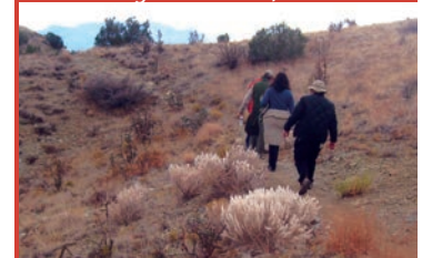
▲ Cerrillos Hills State Park