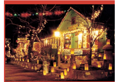
▲ Christmas in Madrid

As you drive on, look at the open range in the direction of the Sangre de Cristo Mountains, you may see antelope.