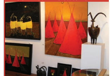
▲ Art Galleries abound