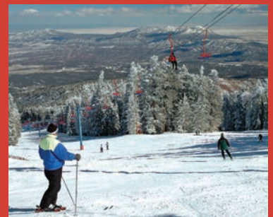
Sandia Ski Area ▲