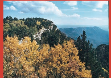
Sandia Crest - 10,678 ft ▲