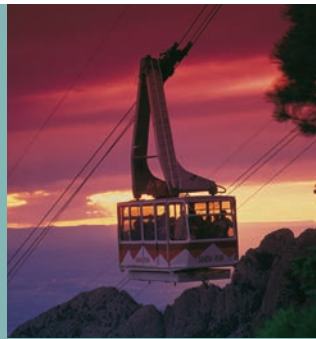
Sandia Peak Tram ▲

CEDAR CREST WEDNESDAYS, 3-6PM CERRILLOS THURSDAYS, 4-7PM