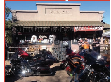
▲ Wild Hogs Movie Set, Madrid