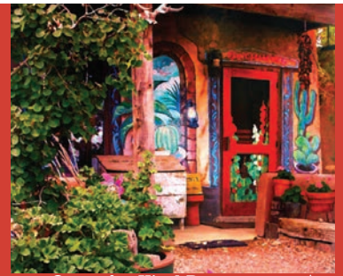
One-of-a-Kind Restaurants ▲