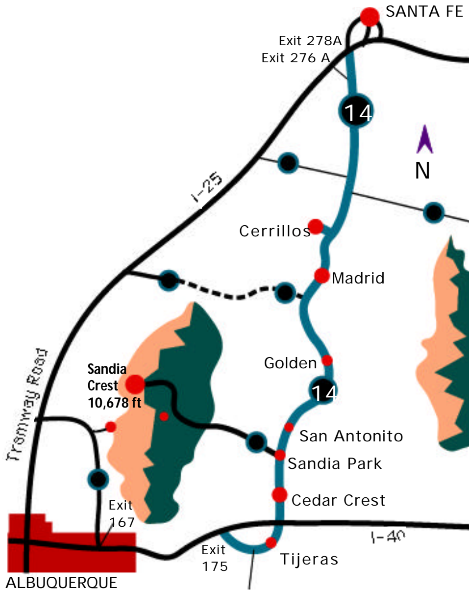
Proposed Turquoise Trail All-American Road

The Turquoise Trail is located in New Mexico approximately 15 minutes to the west of Albuquerque, New Mexico and immediately south of Santa Fe, New Mexico.