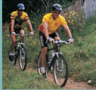
Bike Trails ▲