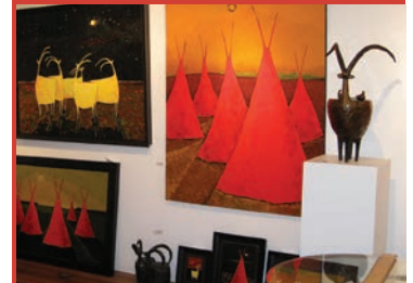
▲ Art Galleries abound