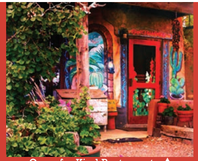
One-of-a-Kind Restaurants ▲