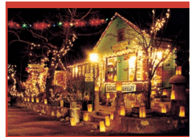
▲ Christmas in Madrid

As you drive on towards THE TOP OF THE TRAIL, look at the open range in the direction of the Sangre de Cristo Mountains, you may see antelope.