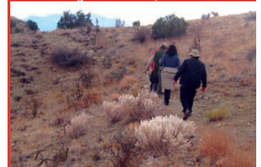
▲ Cerrillos Hills State Park