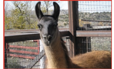
▲ Cerrillos Petting Zoo