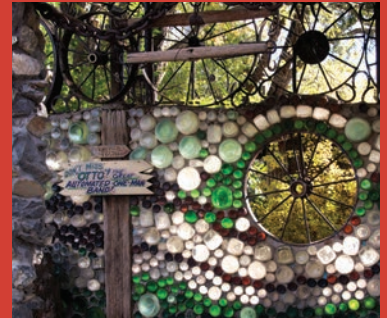
Folk Art Museum ▲