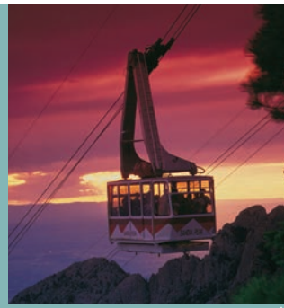
Sandia Peak Tram ▲

FARMER'S MARKETS • MAY- OCTOBER CEDAR CREST WEDNESDAYS, 3-6PM CERRILLOS THURSDAYS, 4-7PM