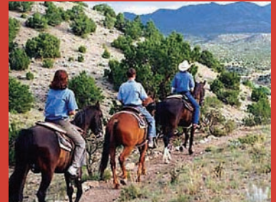
Horseback riding ▲