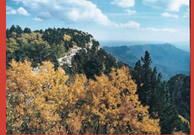
Sandia Crest - 10,678 ft ▲