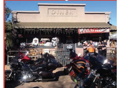
▲ Wild Hogs Movie Set, Madrid