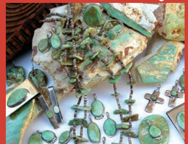
Unique Cerrillos Turquoise ▲