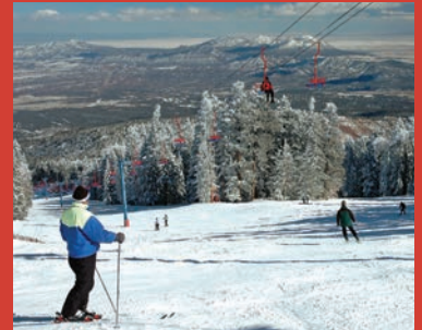
Sandia Ski Area ▲