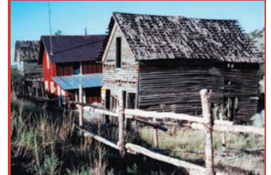
▲ Historic Mining Homes